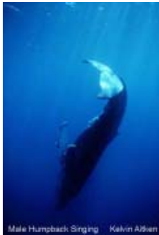
Male Humpback Singing Kelvin Aibani

A Humpback Whale calf drinks around 40 litres of milk every day - the fat content of about 45-60% (human milk is approx. 2% fat) for up to ten or eleven months until gradually weaned onto solid food. Calves stay with their mothers for about a year, sometimes two. This is thought to be due to the necessity of learning complex foraging skills, such as bubble-netting. They weigh 5 - 6 tons and are about 3 - 4 m (12- 13ft) long when born.