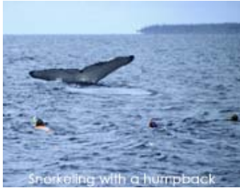
Snorkeling with a humpback

Our research group had an amazing experience with a large group of humpbacks on their last day. It started out with just a mother and calf and then they were joined by other groups of whales, - young males and another mother and calf - over a period of 5 - 6 hours. Everyone had unbelievable personal experiences that day - I was on another boat that day and missed it BUT I have never seen so many eyes sparkling like diamonds when they returned to the mothership that night.